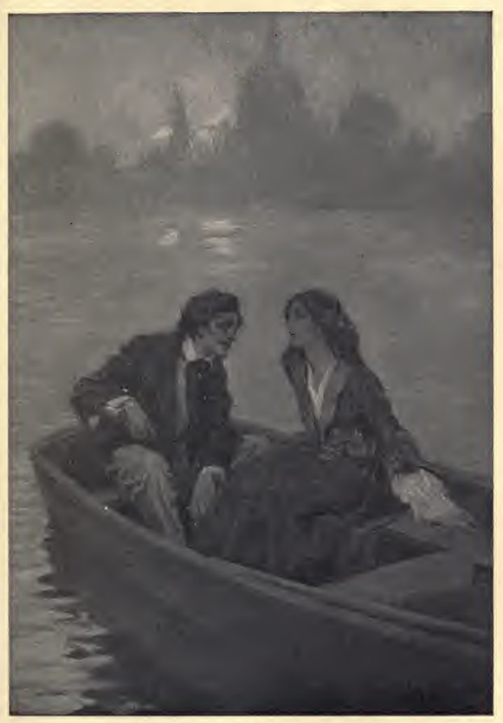
"He leaned toward her in impulsive tenderness"